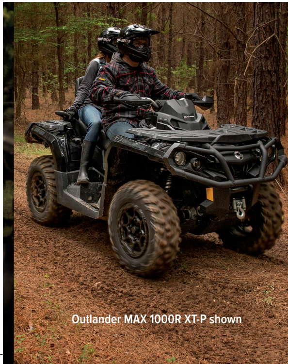
Outlander MAX 1000R XT-P shown

Photo taken outside the European Union, on private or authorized terrain. Ride responsibly, only in authorized locations, and respect the regulations applicable in your country. Respect the environment and other users. Some models and accessories depicted may not be available (or homologated) in your country.