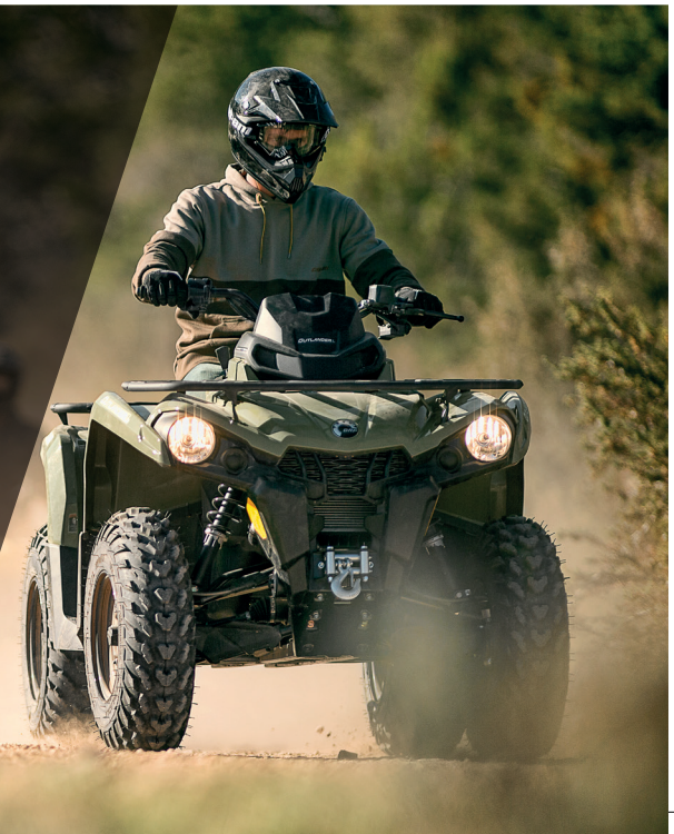
Outlander 450 shown

With the Outlander 450 / 570, we've taken all the things that make our Outlander ATVs successful and made them more accessible than ever. Because whether you're hauling, towing, hunting or hitting the trail, you need a machine that more than meets your expectations.